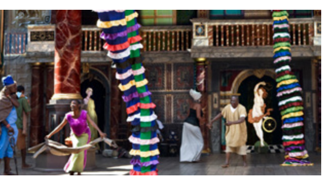
Globe Theatre, A Winter's Tale