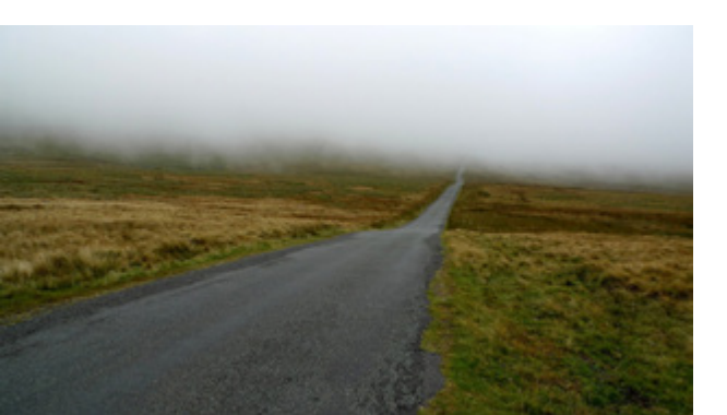
CC0 Public Domain

Two orienting esources for those of you in leadership roles right now: <u>The Psychology Behind Effective Crisis Leadership</u> <u>Tuning in, turning outward: Cultivating compassionate leadership in a crisis</u>