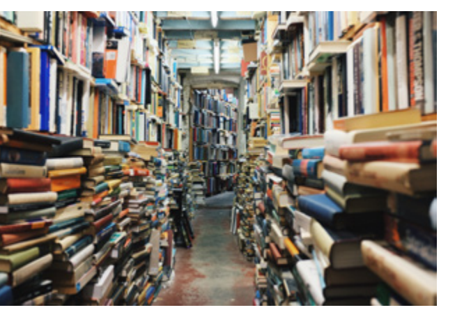
CC0 Public Domain

Over the past couple of months I have been listening to a very enjoyable new podcast by Donal Dineen called <u>Make Me an Island</u>, which dedicates an hour each week to a world tour of music history.