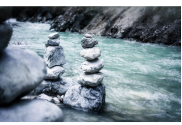
CC0 Public Domain

Now is a time for giving ourselves permission to pause, reflect and take stock so that we respond and adapt from a grounded, connected and wise place more than a reactive one. This takes time, self-care and effort.